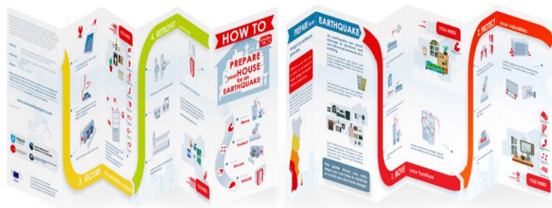
Figure 1: Practical Guide general overview

The remaining of this deliverable, aimed at the description of the conception and contents of the Practical Guide, coincides with the paper “KnowRISK Practical Guide for non-structural earthquake risk reduction” submitted to ICESD - International Conference on Earthquake Engineering and Structural Dynamics. The paper can be found in the following link: https://www.dropbox.com/s/djmg8muw91s29ec/ICESD_Practical%20guide.doc?dl=0